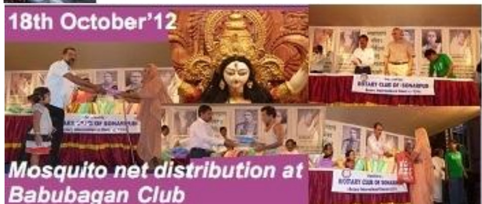
Mosquito net distribution at Babubagan Club