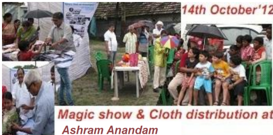
Magic show & Cloth distribution at Ashram Anandam