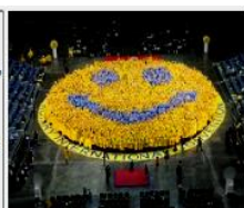
Rotarians form a big Smiley Face during the 2012 RI Convention in Bagkok

Shot in Kenya A child trying to get fresh water for the family, is poignant & unpretentious, telling us an important story