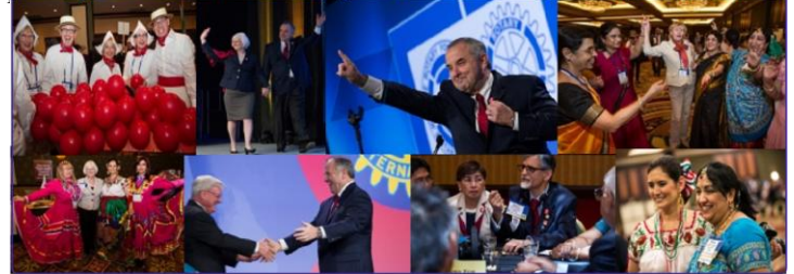
Rotary International Assembly 2013, at San Diego, California, U.S.A.

Netaji Subhash Chandra Bose , born in the year January 23, 1897, has left an important legacy of the freedom struggle in India inspiring the youth of the country. His dedication and devotion to attain complete Independence for India made him play an active role in politics.