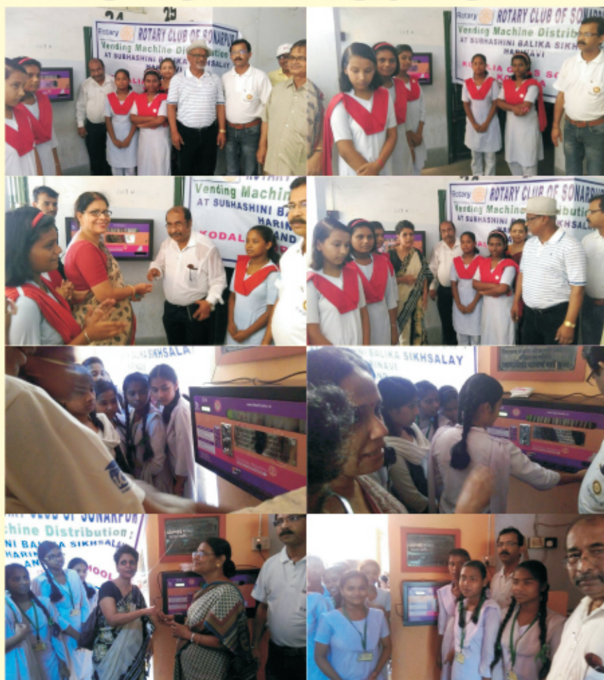
Distribution of Sanitary Napkin Vending Machine Taking Place at Subhasini Balika Vidyalay & Kodalía Girls High School on 13th May