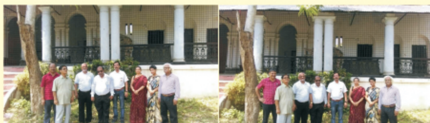
Member's Visited Netaji Subhas Chandra Bose House At Kodalía, 24 Pgs. (south)