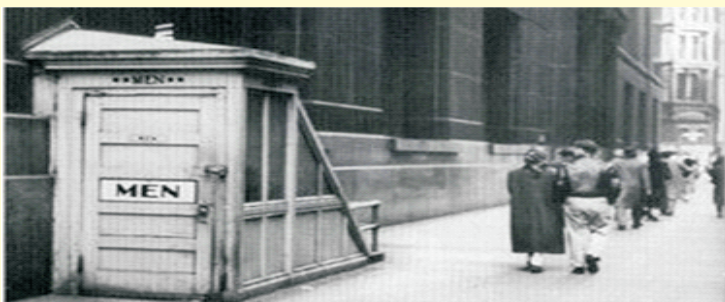
The first Rotary service project was the installation of public toilets in the city of Chicago.