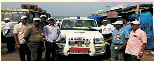
CLEAN INDIA ( DISTRICT PROJECT) MINI ROTATHON (MARATHON) AT KANYAKUMARI BY ROTARY CLUB OF GOLDEN CITY NAGERCOIL. Congrats VIBRANT ROTARY

7 children were operated for their heart surgeries and are feeling great . Thank you Rotary Club of Chandigarh and almighty . Stay blessed all . Service to humanity is the cornerstone of rotary