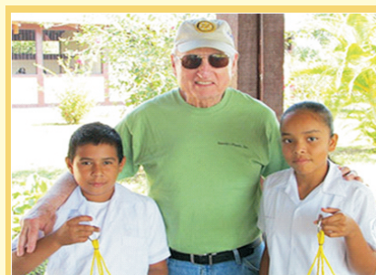
Vince Dooley, former University of Georgia head football coach and athletic director, with children in Honduras during a Rotary service project.

Our Rotary projects around the world are newsworthy. It is worth inviting the media to join us, and share with the world the good work we are doing.