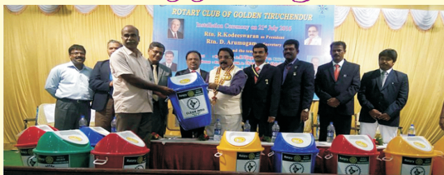
CLEAN INDIA (DISTRICT PROJECT) & HAPPY SCHOOL BY ROTARY CLUB OF GOLDEN THIRUCHENDUR