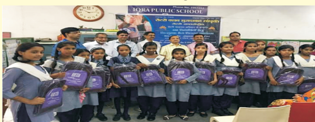
Rotary Club Moradabad Sanskriti distributed 400 School bags to students of Iqra Public School Moradabad. A community service project to support Rotary India Literacy Mission