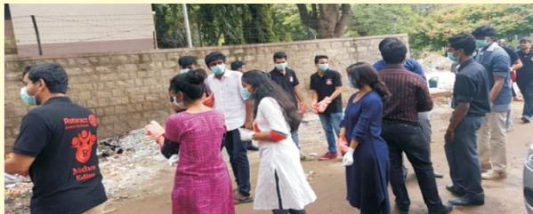
Members of Rotary Bangalore Brigades RI Dist 3190 along with Rotaractors of St Joseph's College in action at Domlur.