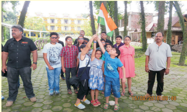
• Club Member Celebrating Independence day 15th August at Malda

RCC Assembly on 28 th August 2016 at Moulali Yuba Kendra at 10 AM.