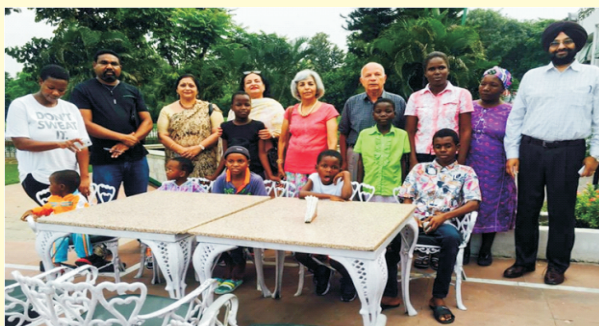
Seven children from Zimbabwe ready to go back home after successful heart surgery under Rotary Club of Chandigarh Heartline project

LENDIG a hand is literally what we are doing with our team of young women who were empowered by little training and now they can run their own clinic