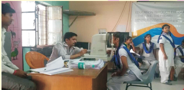
Eye Check up Camp for the under privilege girl children of Delhi Government Schools.