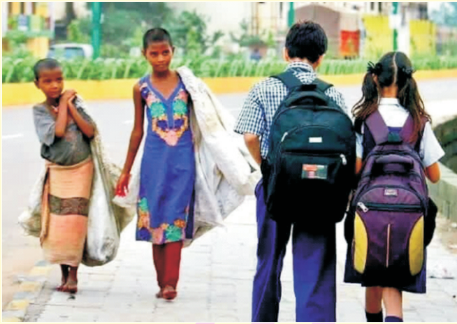
Changed the bag

RCC Assembly on 28 th August"2016 at Moulali Yuba Kendra at 10 AM.