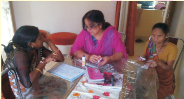
RC INDORE NORTH ADULT LITERACY PROGRAM