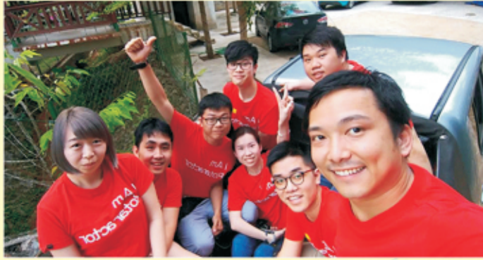
Members of the Rotaract Club of Pudu participate in a service project.

Editor's note: This is the first in a series of blog posts from the 2018 Youth Leadership All-Stars, participants in Rotary's programs for young leaders, in celebration of Youth Service Month.